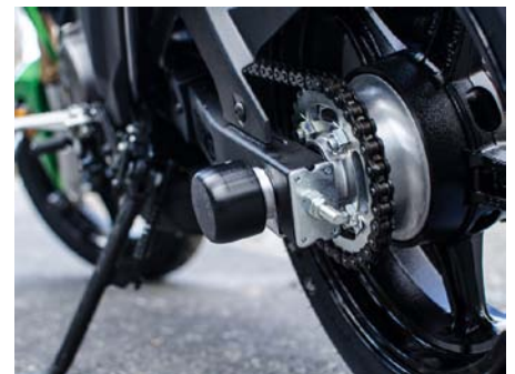
Z125 Pro Rear Axle w/OEM Chain Adjuster